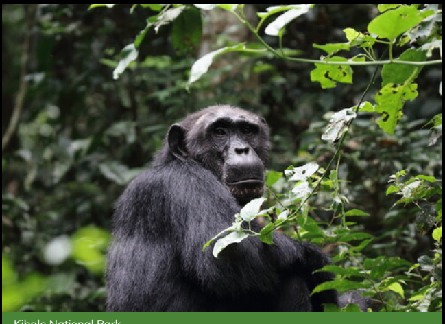
kibale National Park

Protecting a vast tract of tropical jungle near the eastern base of the Rwenzori Mountains, Kibale National Park is probably the best place in Africa to see chimpanzees in their natural habitat. The so-called primate capital of East Africa is also home to a high diversity of monkeys and birds, while a scenic scattering of at least two dozen forestfringed crater lakes provides rich scenic interest.