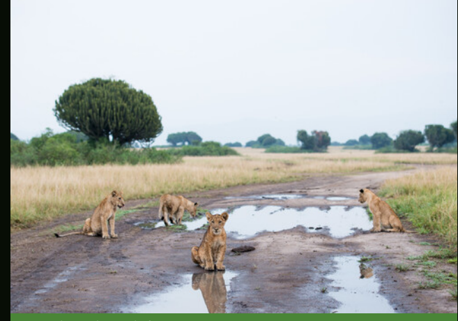
Lion cubs on the road after a rain storm